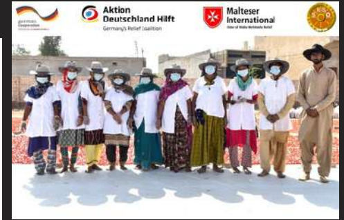
Tomato Cutting Process