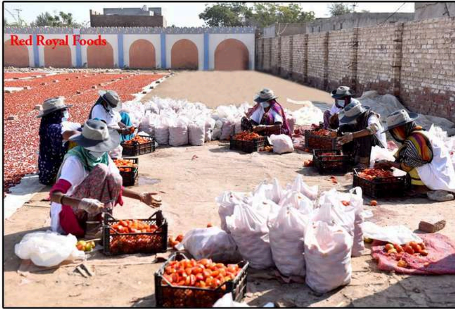
Red Royal Foods