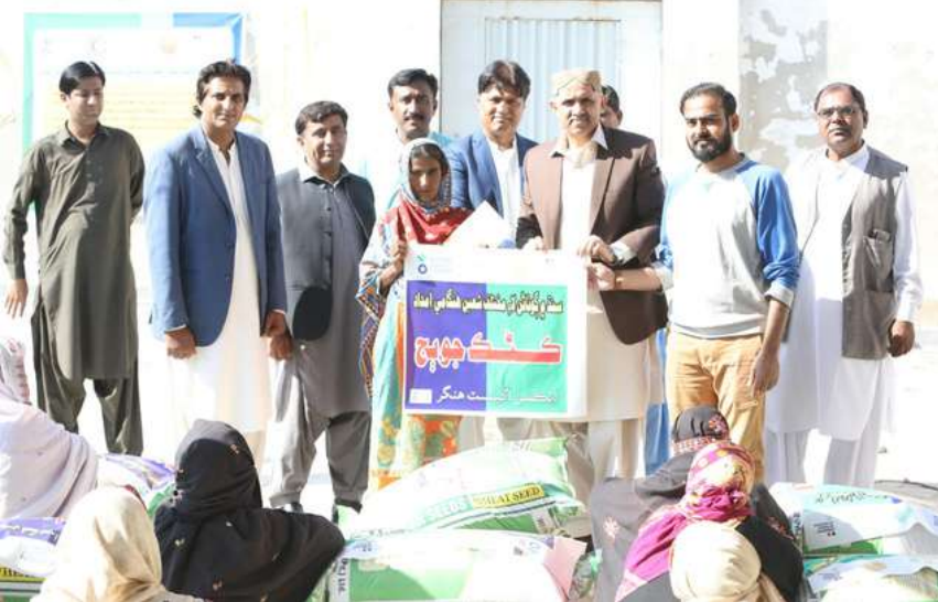
Khairpur Mir's/December 16, 2022

The 220 wheat seed bags were distributed among the 110 calamity-hit farmers to cultivate the crops in order to ensure food security and improve their livelihood by Sindh Rural Support Organization (#SRSO) under Action Against Hunger (#ACF) funded Multi-Sector Emergency Support for Communities in Sindh project. For this purpose, a detailed assessment was conducted in targeted areas to identify the most vulnerable farmers. The livelihood support was provided to 110 vulnerable farmers of the most flood affected 09 villages of Union Council Drip Mehar Shah and Kolab Jeal, Taluka Kingri District #Khairpur Mir's'.