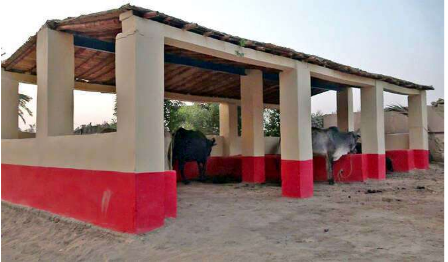
The picture taken on June 17, 2025, shows cattle tied at a climate-resilient shelter built in Thari Mirwah in Pakistan's Khairpur district by the German relief organization Malteser International.