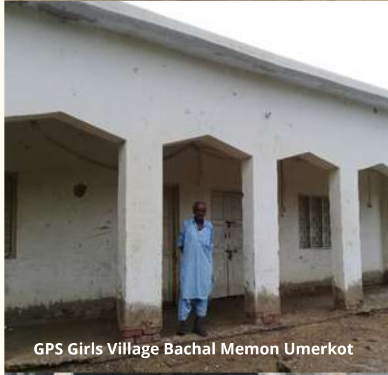
GPS Girls Village Bachal Memon Umerkot