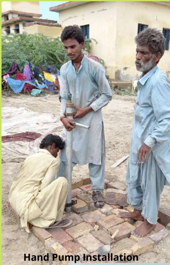
Hand Pump Installation