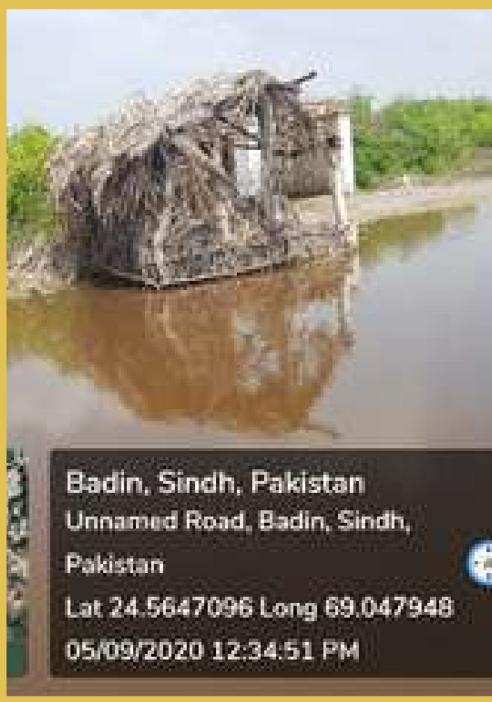
Badin, Sindh, Pakistan Unnamed Road, Badin, Sindh, Pakistan Lat 24.5647096 Long 69.047948 05/09/2020 12:34:51 PM