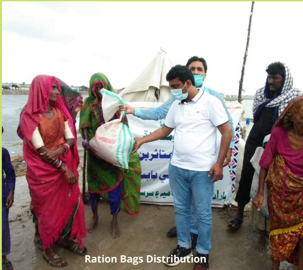
Ration Bags Distribution