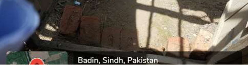
Badin, Sindh, Pakistan