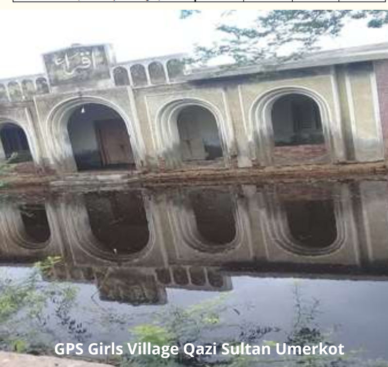
GPS Girls Village Qazi Sultan Umerkot