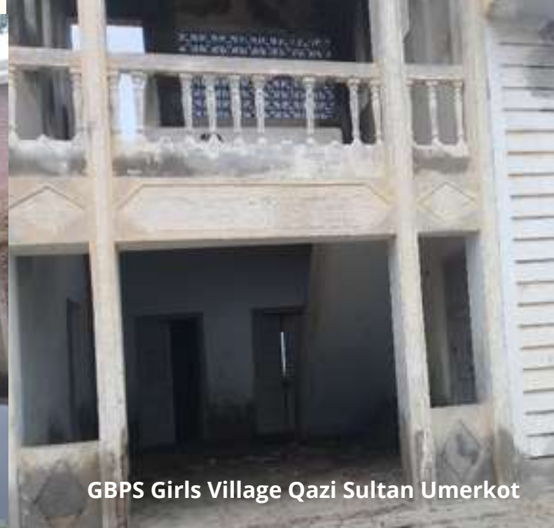
GBPS Girls Village Qazi Sultan Umerkot