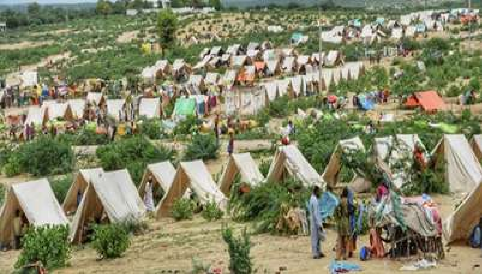
Tent City established by District Govt: Umerkot.