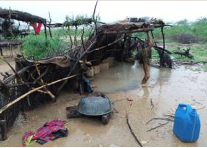
Detail of Damages