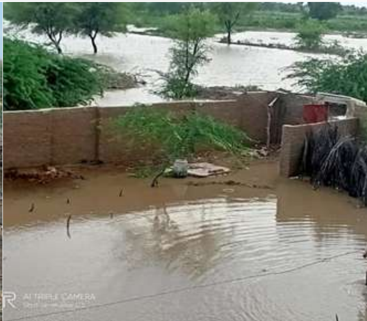
UC Nawab Abad Taluka Kunri