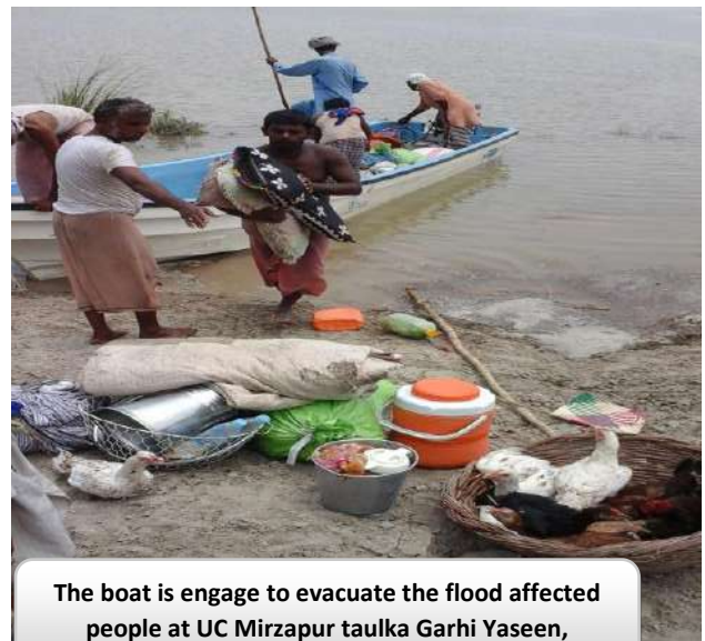
The boat is engage to evacuate the flood affected people at UC Mirzapur taulka Garhi Yaseen,