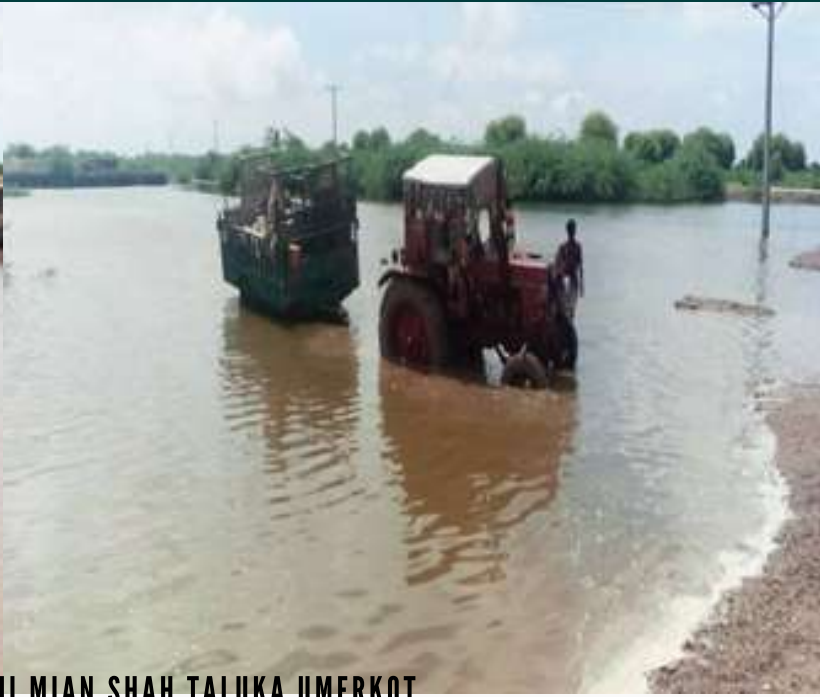
VILLAGE RANA JAGIR UC HAJI MIAN SHAH TALUKA UMERKOT