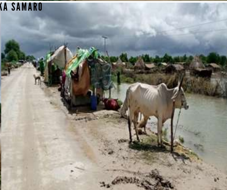
RAIN AFFECTED HOUSEHOLDS OF TALUKA SAMARO HAVE BEEN SHIFTED TO ROADS, THIS ROAD IS OF SAMARO TO UMERKOT.