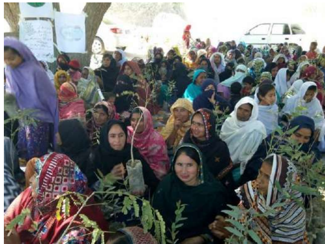
LSO Roshan Abad Sukkur Office Bearers and members