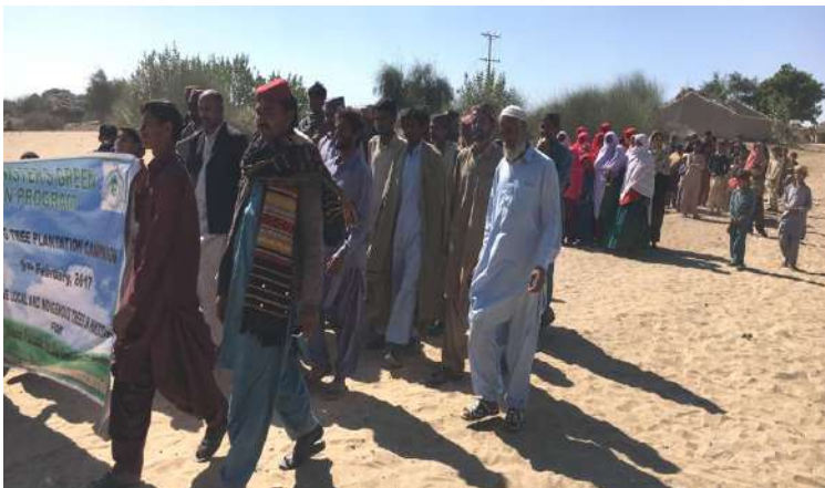
A rally on tree plantation by Senior Citizens and Community