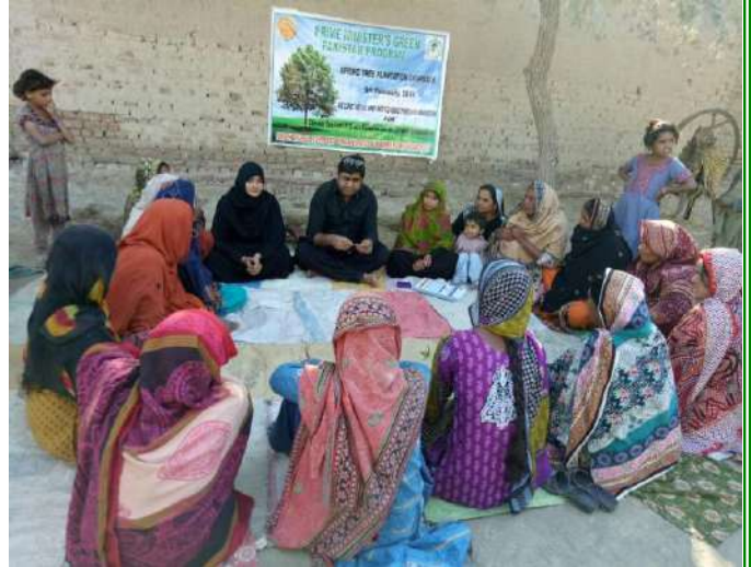
Session on Importance of Plantation at Kamber-Shadad Kot