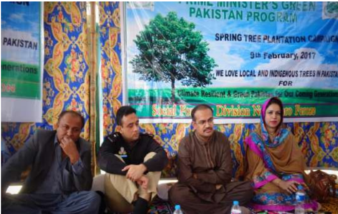
Jail Superintendent with SRSO Team at Noushero Feroze