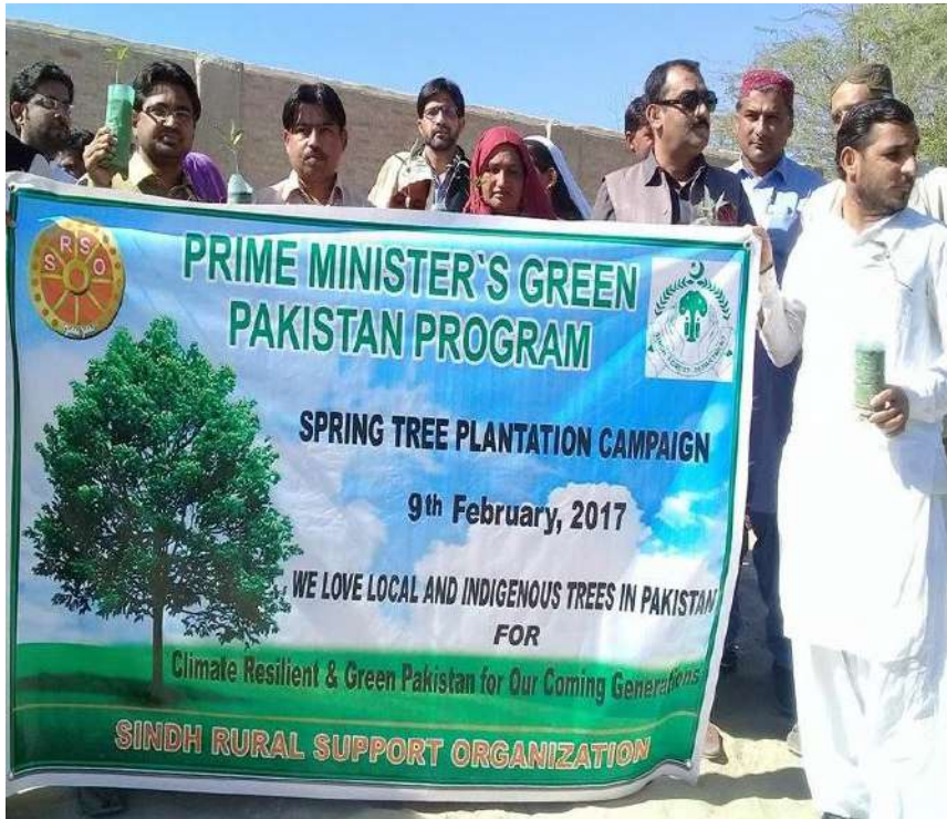
SRSO District Kandh Kot team and other stake Holders