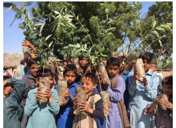
School Kids with plants