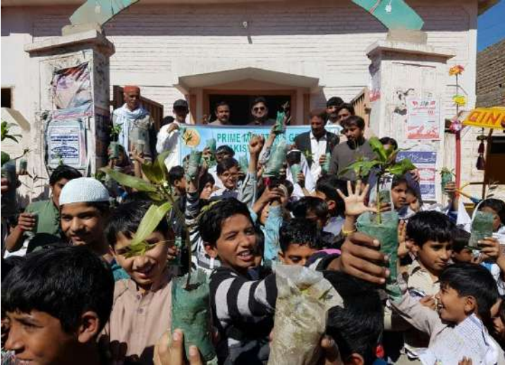
Plant distribution in a Community School