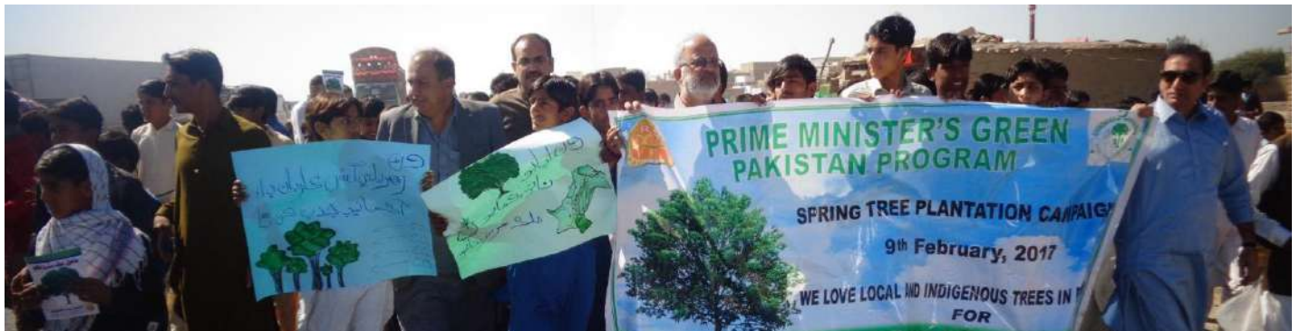
A walk by Notable Citizens and Organised Community members