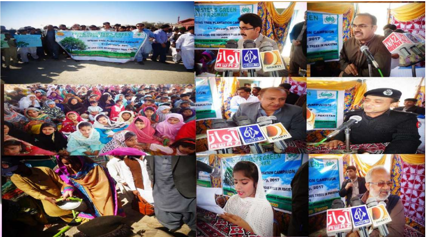
A view of Green Pakistan Celebration at Noushero-feroze District