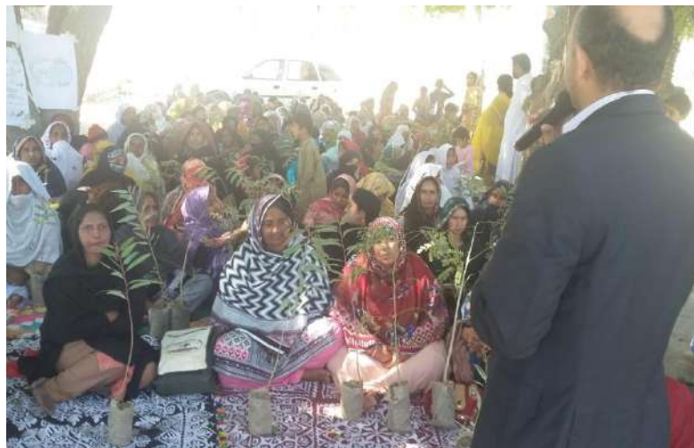
CEO-SRSO delivering session on tree plantation