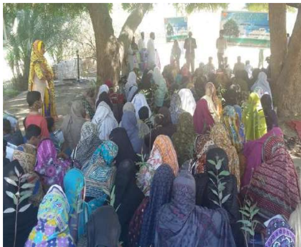
Organized Community with Plants