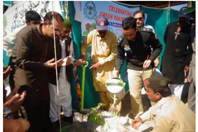
Police Officer planting a sapling