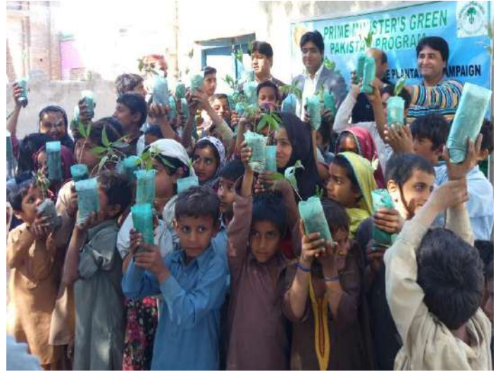
School Children with plants at community school Larkana