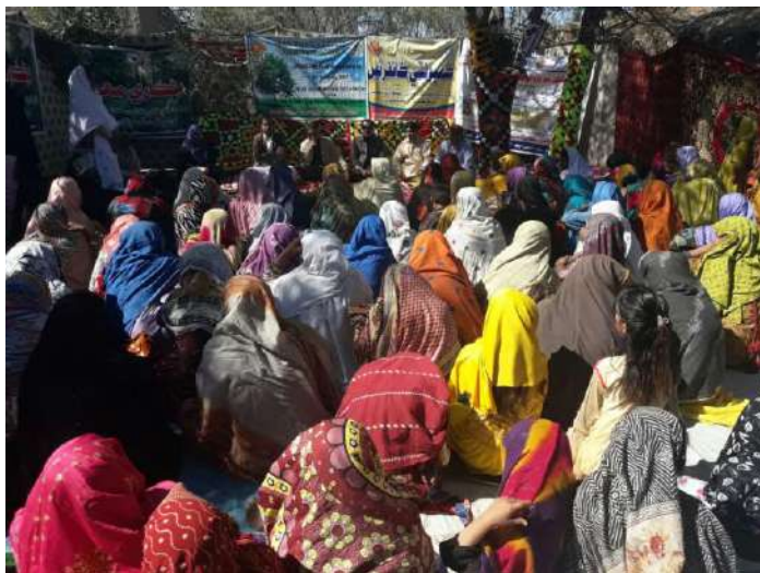
District Kandh Kot Organised Community Members of CO/VO/LSO