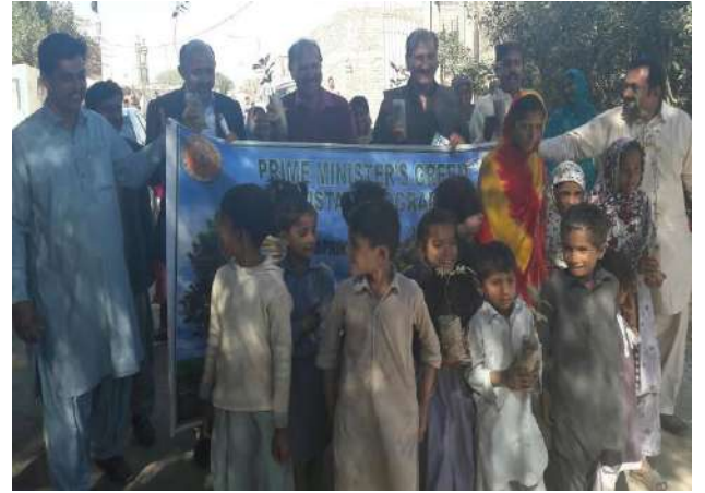
School children and community with plants