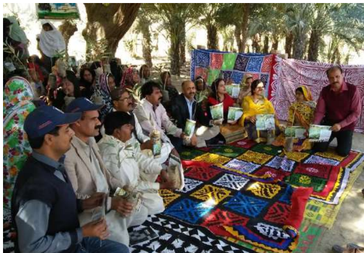
CO/VO/LSO community with SRSO Team