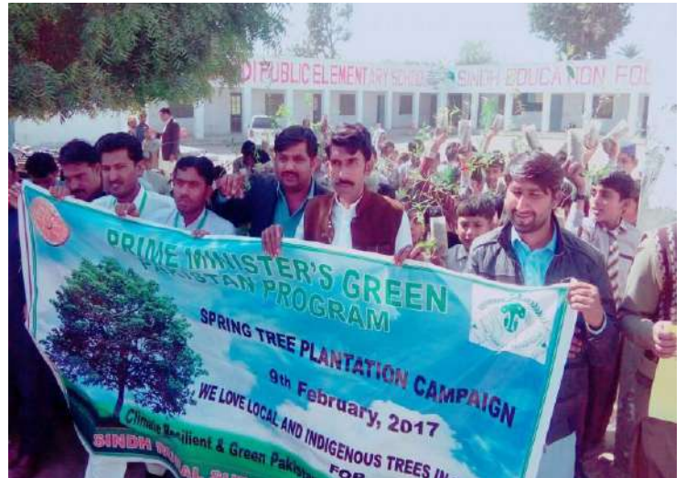
A walk by organized Community and notable persons