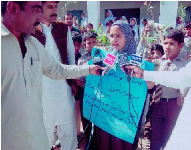
Media Talk by a School Kids at Community School Ghotki