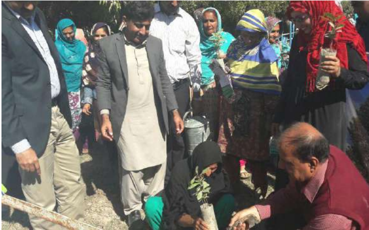
LSO Tando-Masti (Khairpur) Chairperson planting a plant