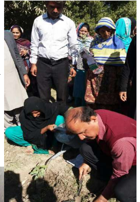
CO/VO/LSO members of organized Community with Plants at Tando-masti