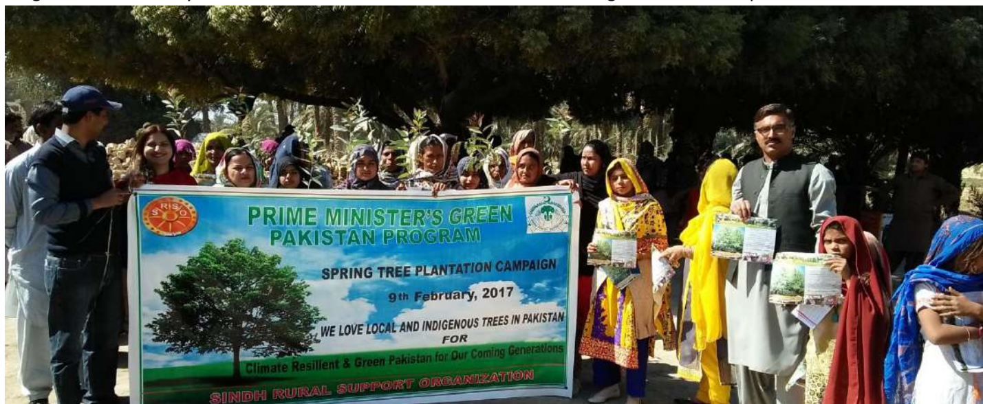
A walk of Organsied Community Institutes on tree plantation Importance