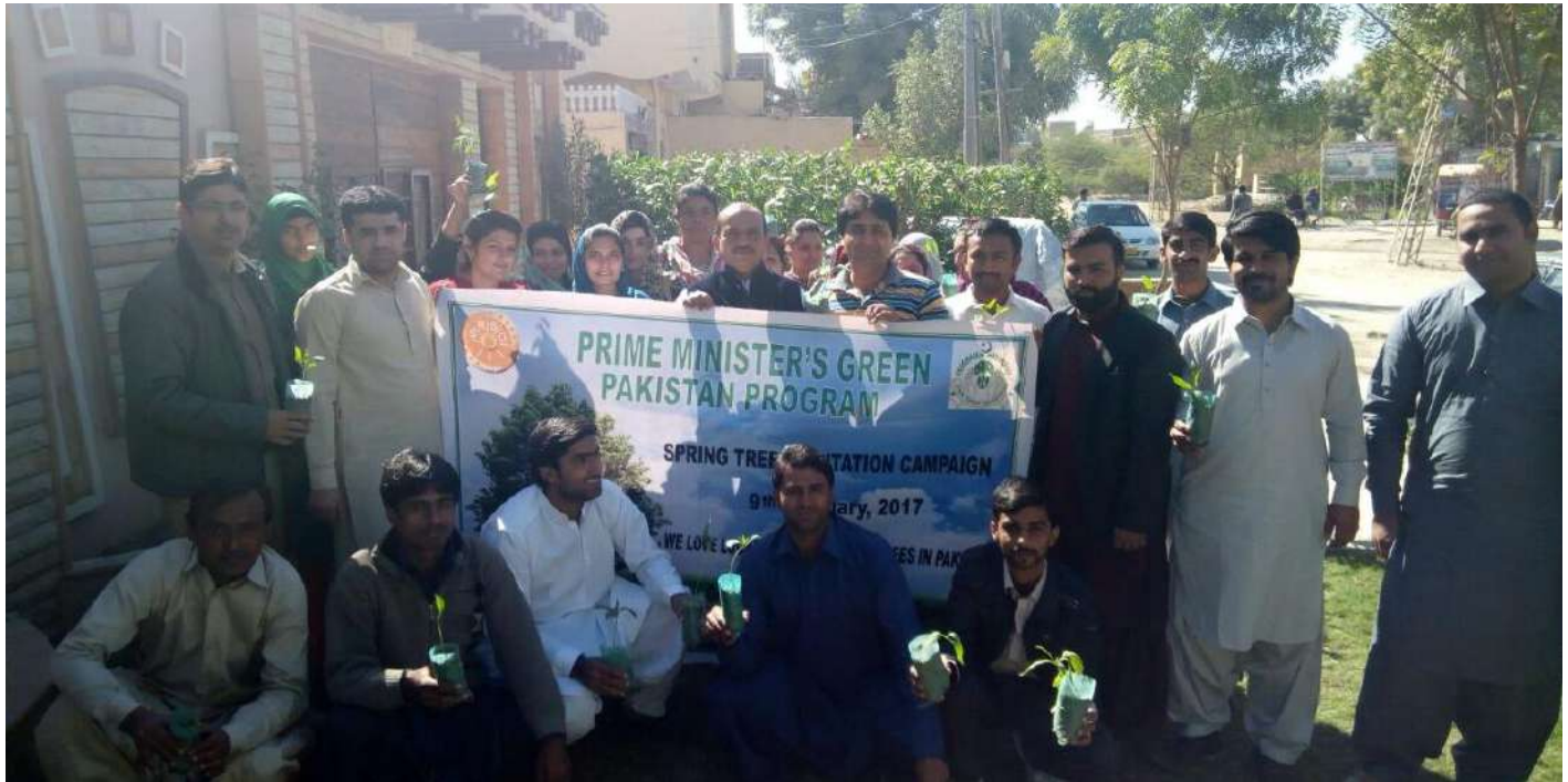
Larkana SRSO-SUCCESS Team with Plants