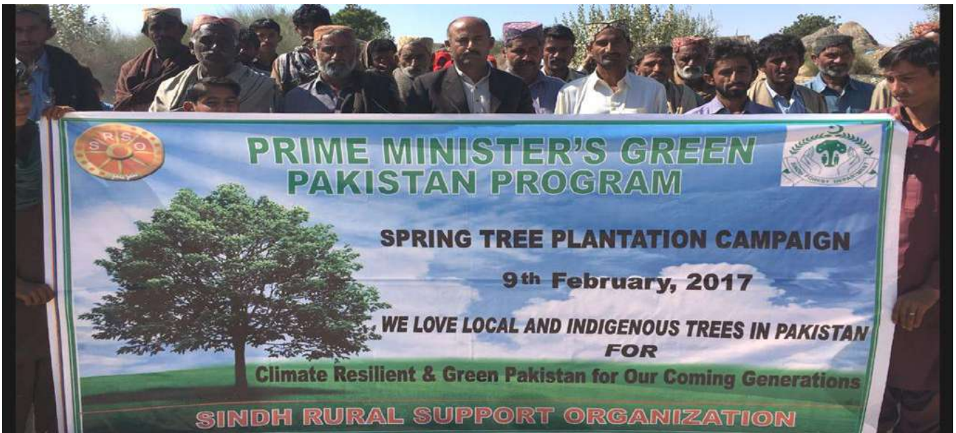
Walk at Ghotki by Organised Community