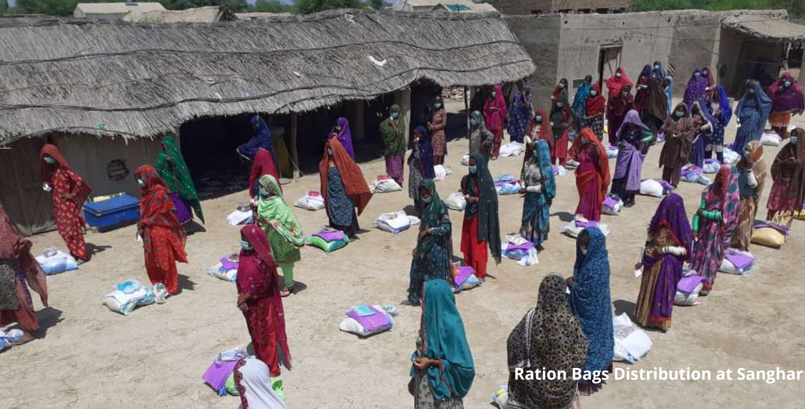
Ration Bags Distribution at Sanghar