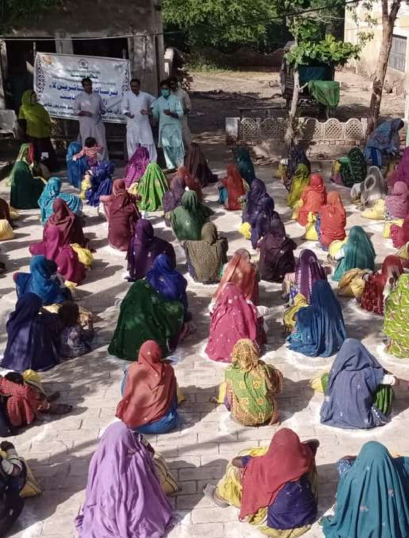
Ration Bags Distribution at Mirpurkhas with dignified and managed way.